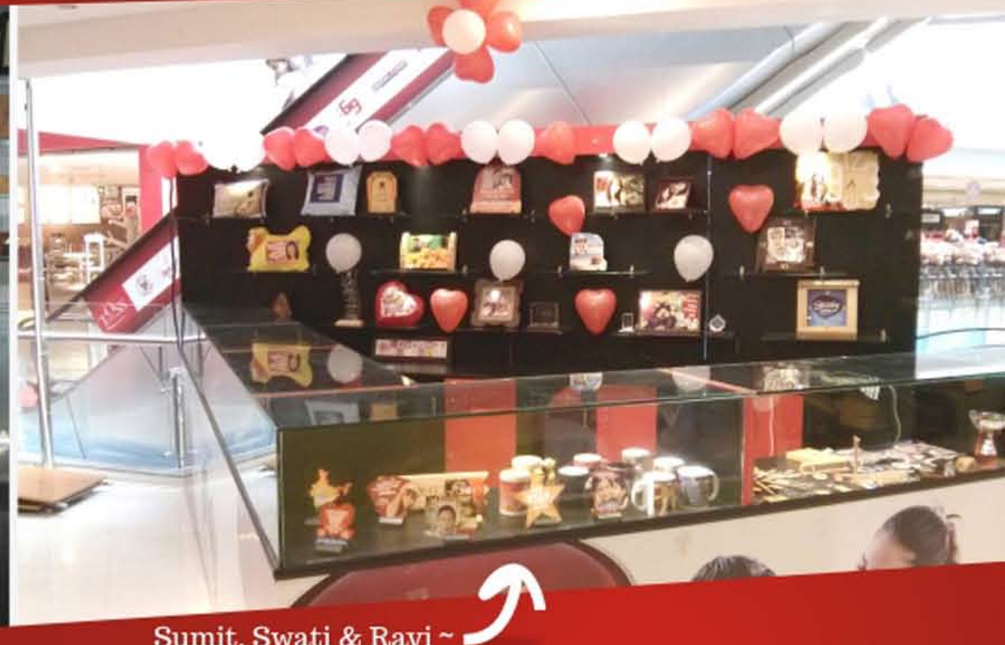
Sumit, Swati & Ravi ~

Lukose Creations LLP - Presto | Garuda Mall | 3rd Floor (Near food court) Magrath Road | Bangalore 560025 | Karnataka